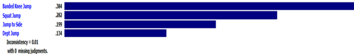
Fig. 3. Eigenvector plyometrics using the expert choice application.

Priorities with respect to: Goal: Plyometrics pairwise