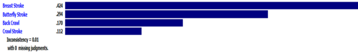
Fig. 2. Eigenvector swimming style using expert choice application