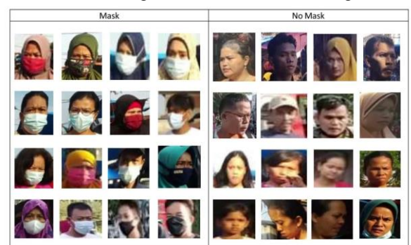
Fig. 3 Image dataset of masks and non-masks

In table 1 describes the details of the results of data collection of community activities used to detect masks and non-masks with a total capacity of 3.5 GB. From this dataset set will be done extracting videos into images for labeling people with masks and non-masks. The total number of images is 1,326. some images of people using masks and non masks in the images used can be seen in fig. 3