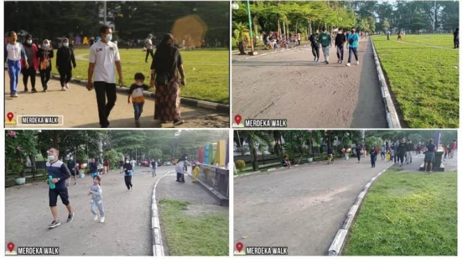
(c) Fig. 2 Sample Place Observation