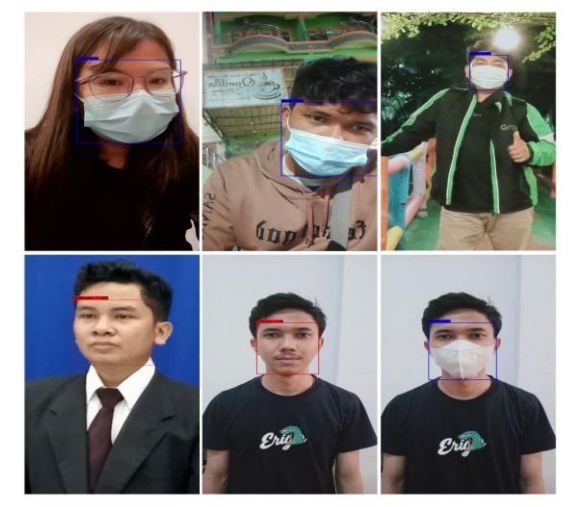
Fig. 6. Image detection results

In table 3 is the result of the details of the train dataset test, valid and test of a total of 1,326 images used, it is seen that for train data produces accuracy of 94.65%, valid data 88.45% and tests of 92.12%. From these results prove that the data weights in the 2000 iteration has produced accuracy above 90%, then the next step is to test new image data sourced from video data that is not used as a source of label data. The results of image detection can be seen in fig. 6.