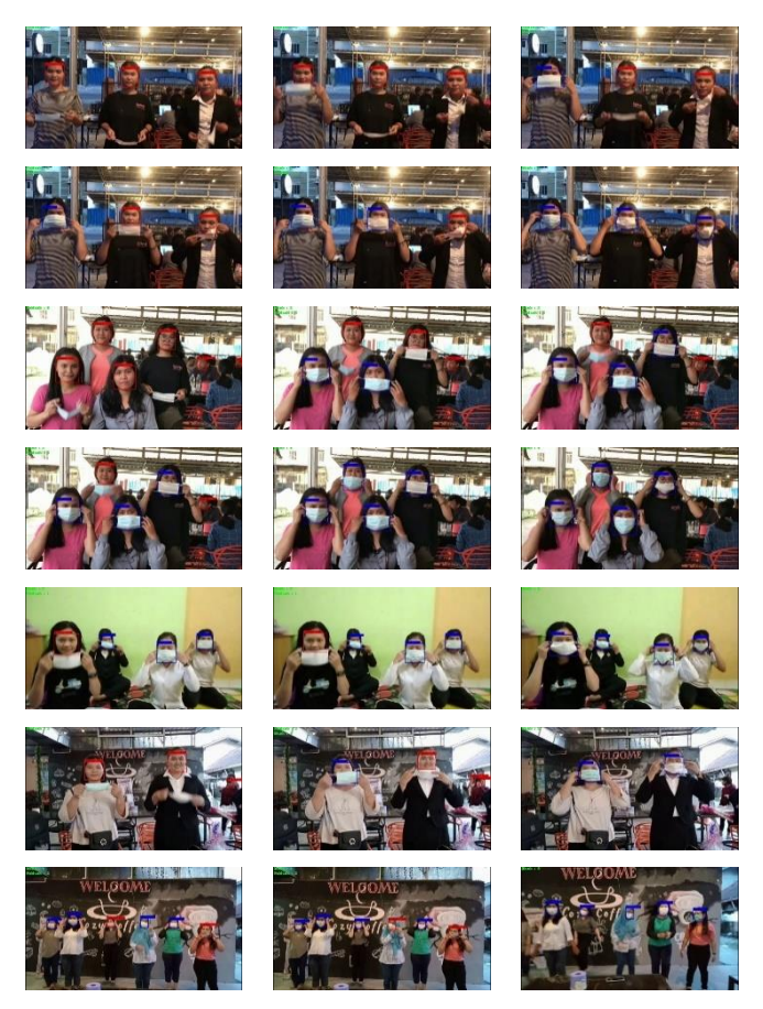
Fig. 9. Video Detection

Based on fig.9 YOLOv4 can detect faces that do not wear masks with hand barriers, masks open, but for obstructions by using masks that are used in inappropriate positions and face barriers using wipes detected as a mask person, in this case there is a detection error where in this position is not in the training image. Further testing is done by recording the scene of several people in the video with the initial position not using a mask, then everyone uses a mask. This test aims to measure the accuracy and speed of the YOLOv4 model in detecting masks and the test results are presented in fig. 9.