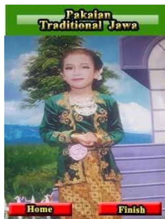
Fig. 3 Javanese Traditional Clothing

Interface design is very important in software development, especially in developing game applications. The user interface is a bridge of interaction between the user and the system, besides that the design of the characters and characters in the game must also be planned properly and attractively. So that users will feel comfortable and interested in playing games. The interface design must also be able to describe the value or story that will be conveyed in the form of a game to the user. The designed essays are then translated into code through events to implement the logic of the program. This implementation process is carried out on the development software. The product made is an android app that contains local culture-based interactive English reading learning game for primary school students. This app can be accessed on smartphone or tab that operated in android operating system (OS), as a result, students enable to learn independently in anywhere and anytime. Figure 3 illustrates the application game interface installed in android OS-based smartphone or tab