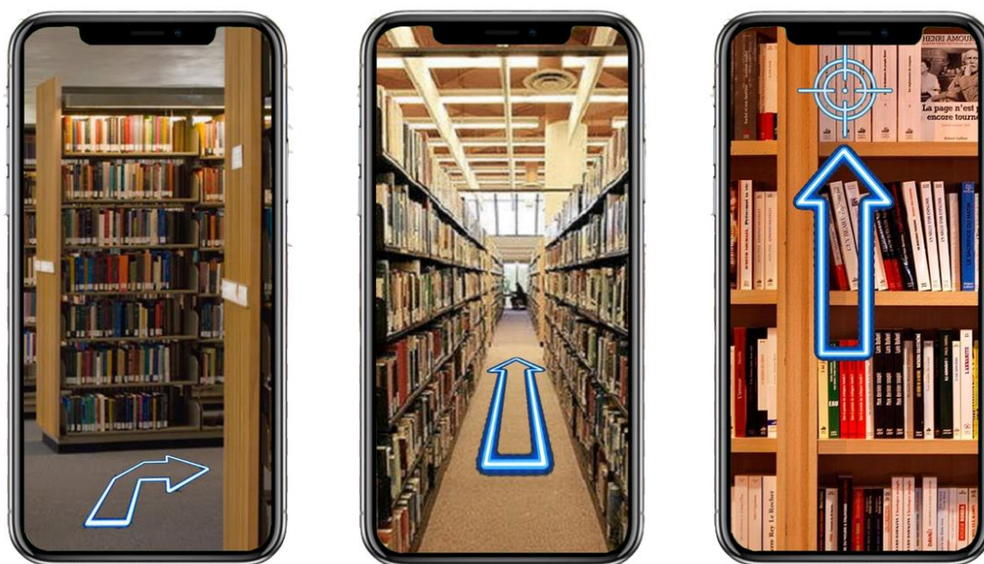
Figure 3. One of the models for augmented reality with the help of AR Makar software

From the results of the experiment 10 times, there are 2 that are not in the right location for the book and the location of the DVD. The results of the accuracy of the experiment showed 83.33%